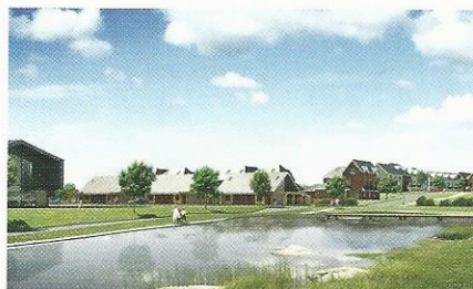
Sustainable drainage and ecological enhancement adjacent to extra care living