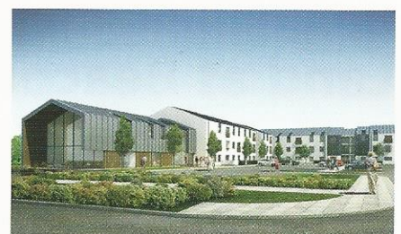
A bespoke retirement complex