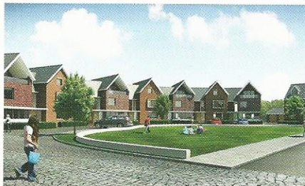
Crescent of executive townhouses to the north of the site